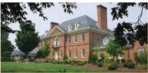
The Governor's Residence