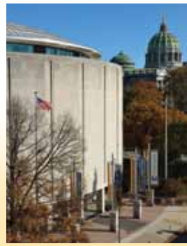
The State Museum of Pennsylvania